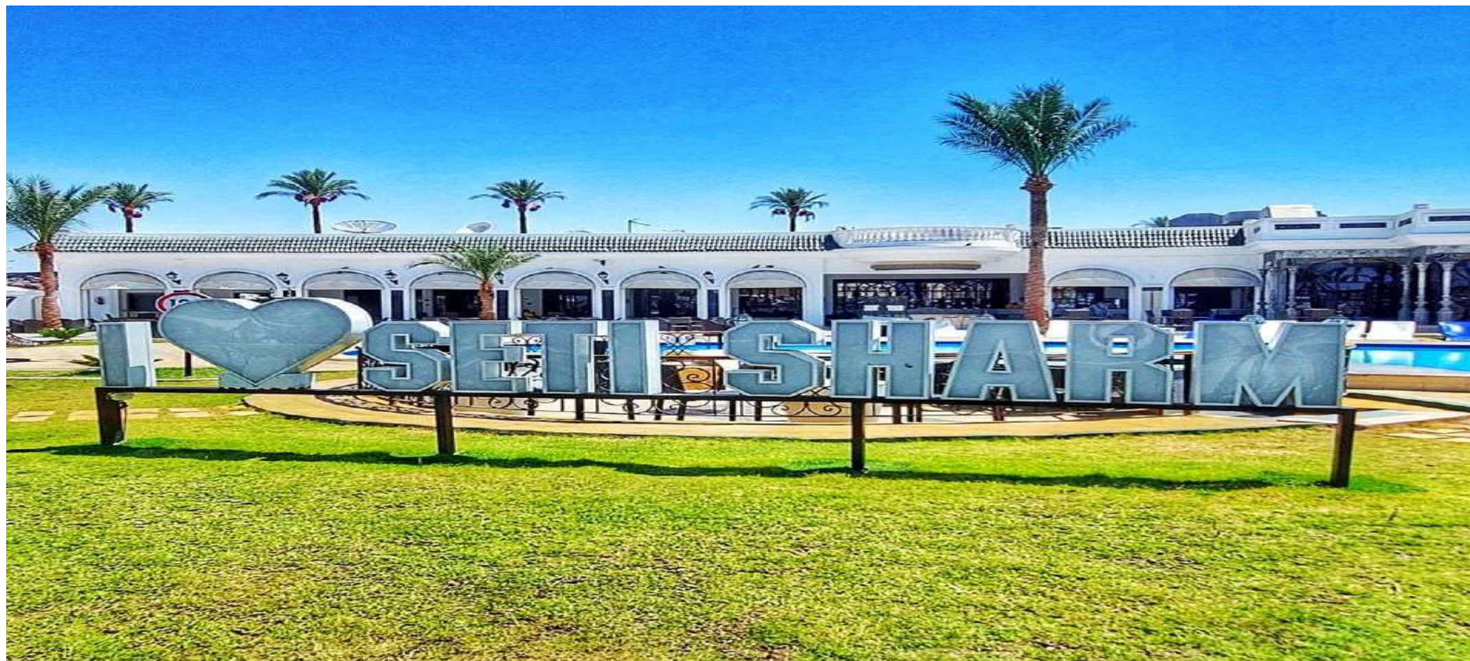
Seti Sharm Resort