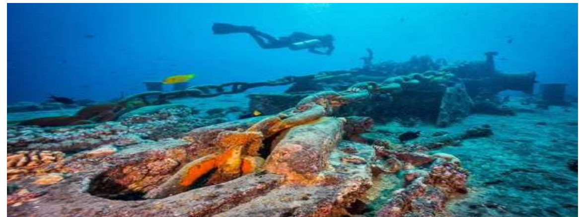
Seti Sharm Resort