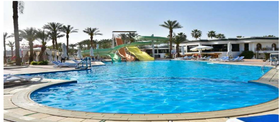
Seti Sharm Resort