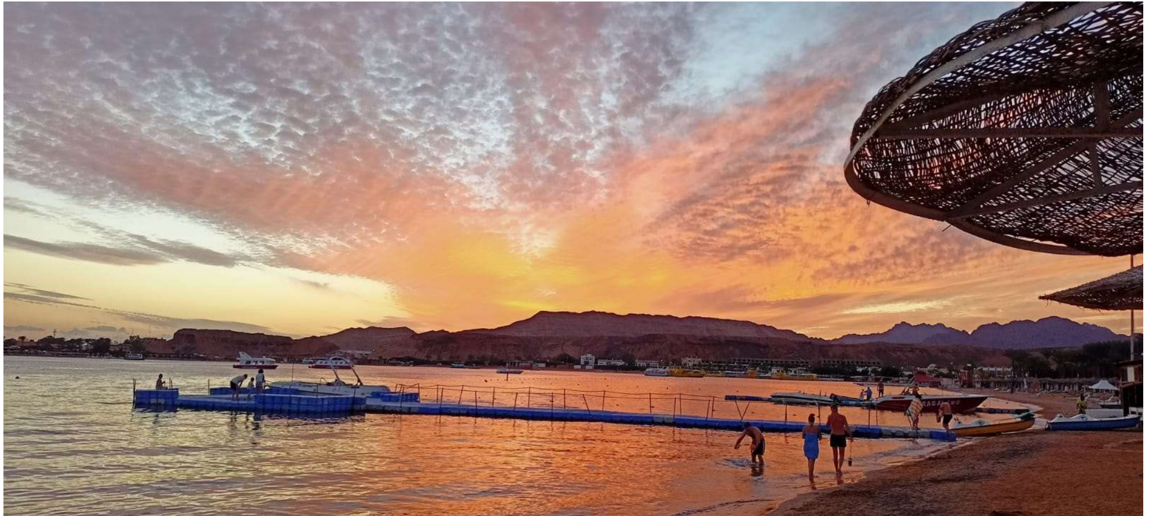
Seti Sharm Resort