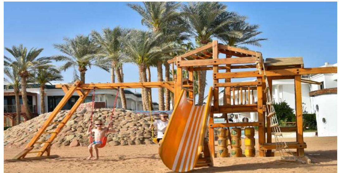
Seti Sharm Resort